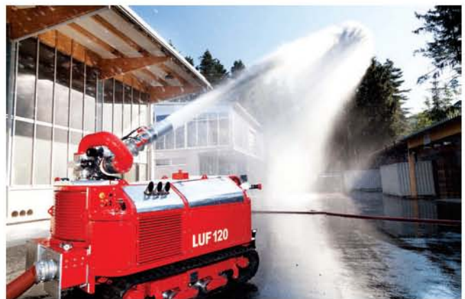
The LUF 120™ in action

State-of-the-art control elements enable easy handling and high precision operation. The radio-controlled unit has additional back-up manual controls in the event of a power supply failure.